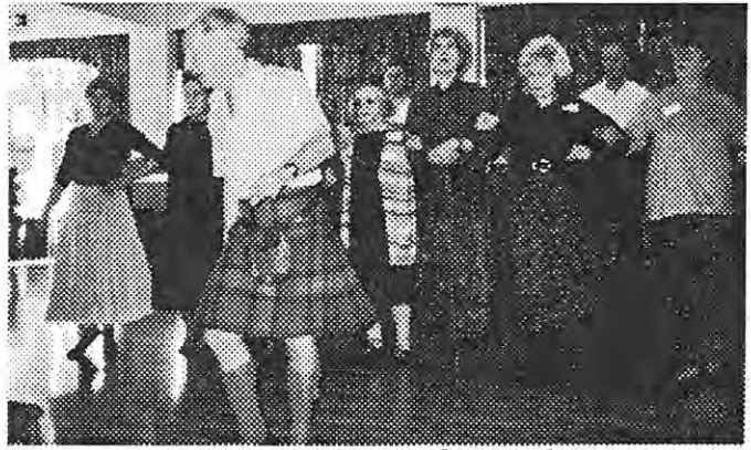
Cosy Pas de Basque practice.